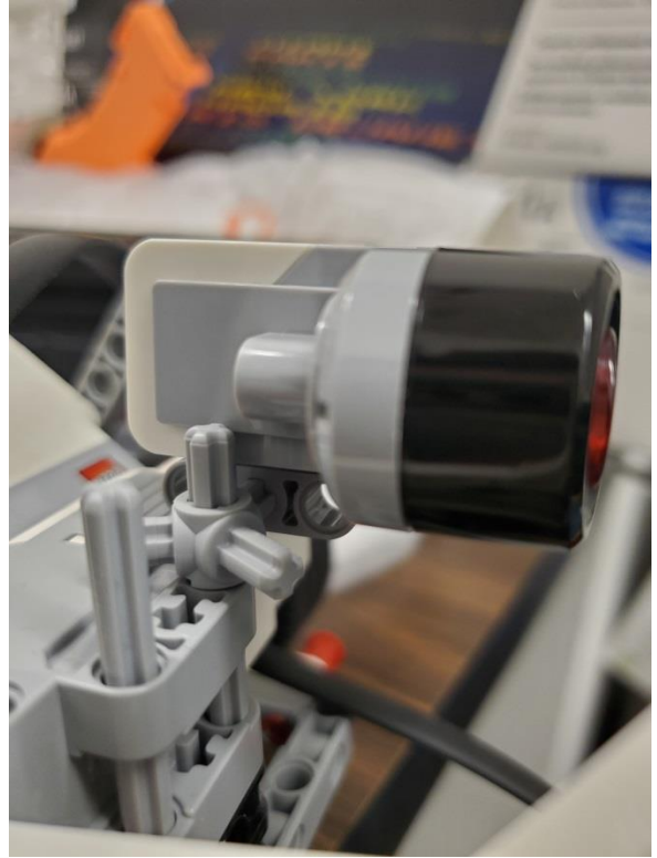
Ultra-sonic sensor attached