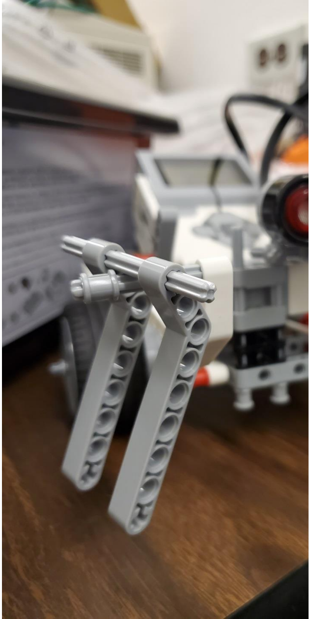
Robot part carrier assembled